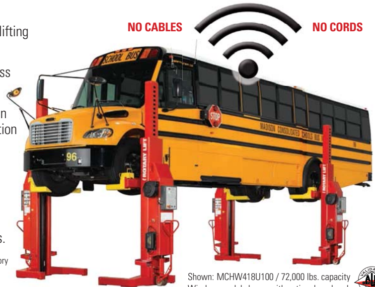
Shown: MCHW418U100 / 72,000 lbs. capacity Wireless model shown with optional cord reels